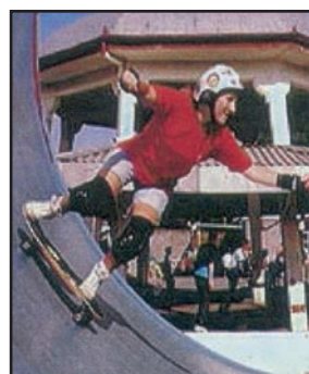
Skateparks give skateboarders a chance to practise their sport

We have learnt that some people are worried about skating behaviour. Everyone agreed - the public, police and skateboarders too - that there